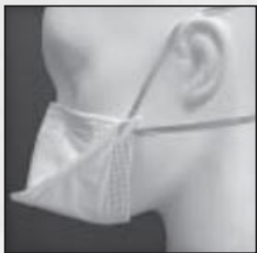
"Duck beak" Style

In brief, both N95 and KN95 rated masks are effective at filtering out at least 95% of particles. FFP2 masks are rated at 94%. For this reason, N95 and KN95 masks are very slightly more effective than FFP2.